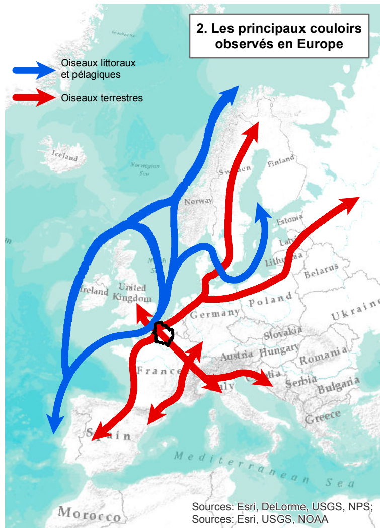
2. Les principaux couloirs observés en Europe

➡ Oiseaux littoraux et pélagiques ➡ Oiseaux terrestres